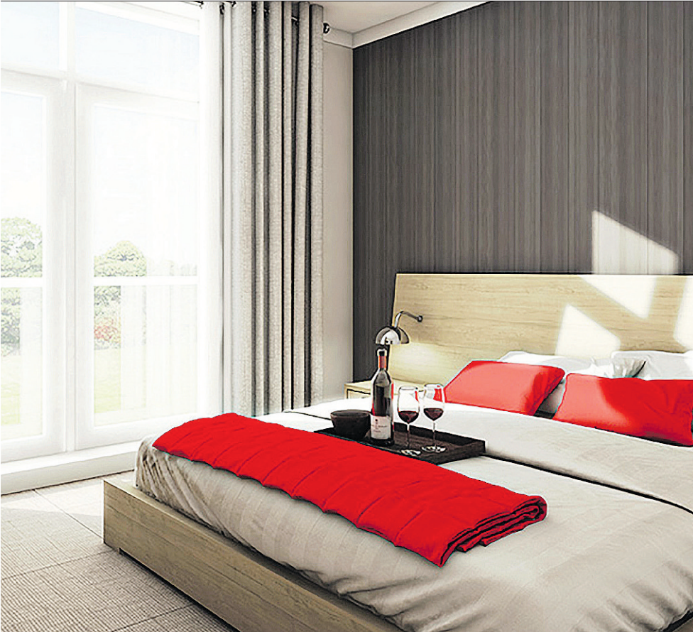
The four-star Hôtel Valcartier opened recently at the heart of an elaborate family playground. The dazzling new Bora Parc, right, part of Village Vacances Valcartier, is six times the size of an NHL hockey rink and is designed for all tastes, from laid-back lounging to wave adventures for the more daring.